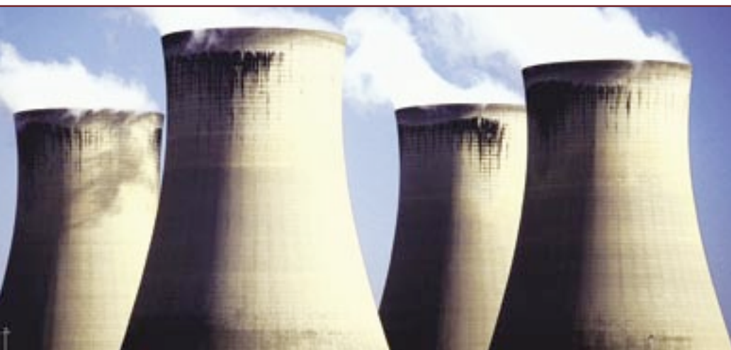
A nuclear landscape.

The World Bank should affirm that its funds will not be used, directly or indirectly, for nuclear power projects.