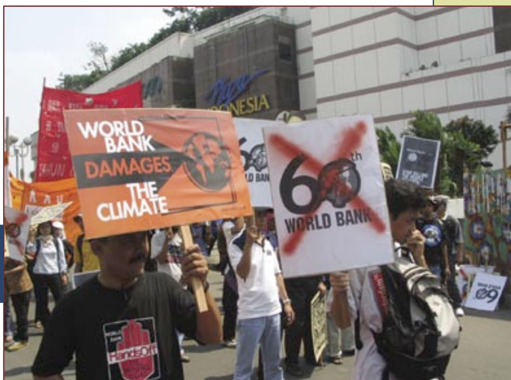
World Bank protest in Indonesia.

Large hydropower projects (above 10 MW), particularly in tropical areas, should not be considered a renewable or “clean” technology, given their social and environmental impacts and the likelihood that they will create substantial greenhouse gas emissions.