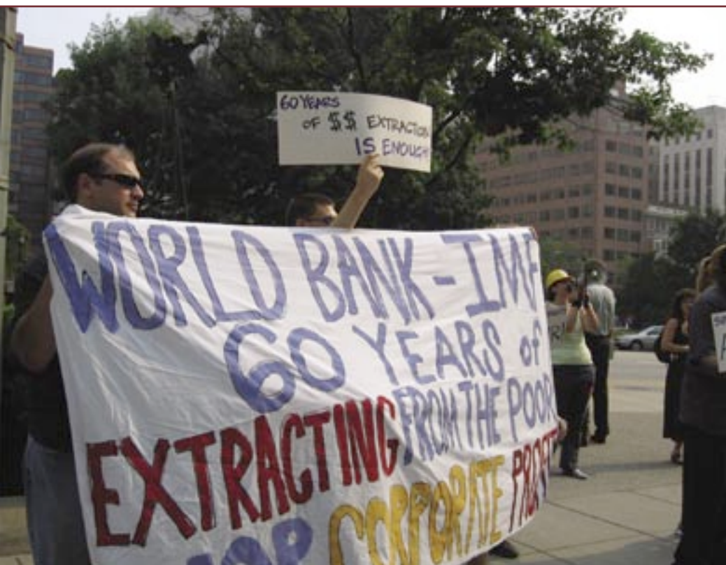
Protests in front of the World Bank in Washington, DC.