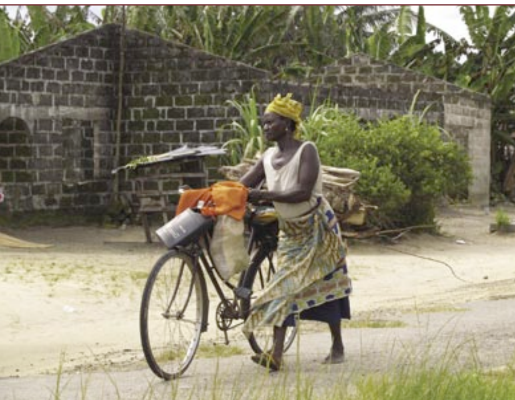
Woman walks her bicycle in the Niger Delta.