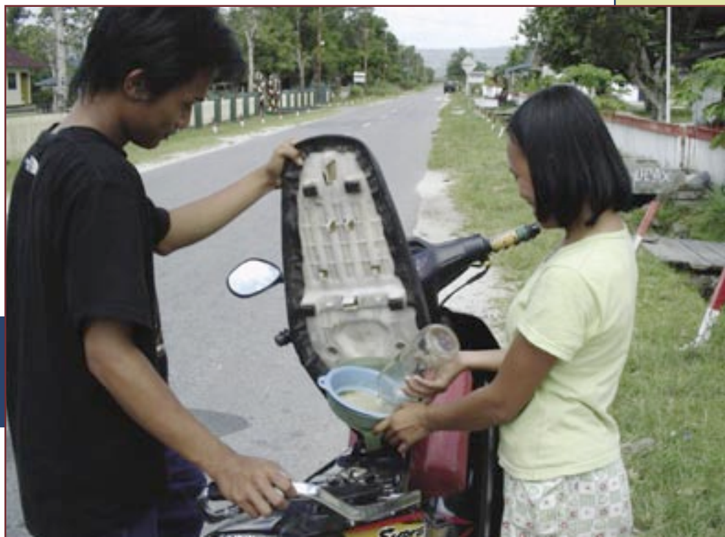
Filling up gasoline for a motor bike on Sulawesi, Indonesia.

The emissions reductions realized through the carbon funds are thus massively outweighed by emissions production from projects in the Bank's overall energy portfolio. Through the PCF, the Bank is counting (down to the half-ton), the greenhouse gas emissions supposedly avoided through carbon-credit earning projects. At the same time it refuses to calculate the carbon emissions from its own energy investment portfolio. In this way, the Bank counts what it prevents but not what it produces, masking the net impact of its energy operations on climate change.