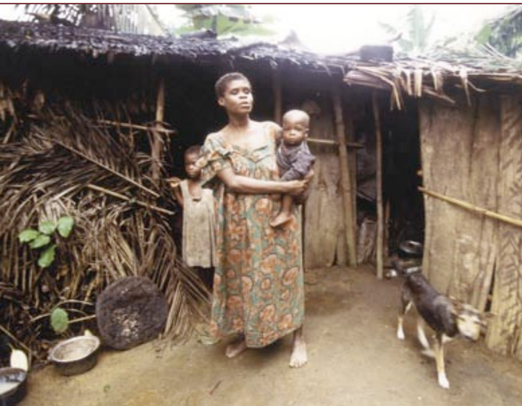
Bakola ‘pygmy’ woman at settlement near the Chad-Cameroon Oil Pipeline, supported by the World Bank.

These are the types of energy that should be promoted by a multilateral agency looking to transition out of fossil fuels and onto a low carbon path.