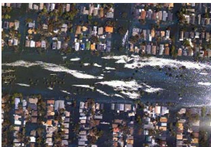
Hurricane Katrina devastated the US South.

■ Protestors killed in India: Three civilians were killed and more than 30 injured on December 14 when security forces opened fire on demonstrators protesting the construction of Khuga Dam in India's Manipur state. Dam-affected people and NGO activists were also subjected to severe repression in other incidents in India's Narmada valley, in Brazil, China, Ecuador, Honduras, Mexico, Sudan and other countries in 2005.