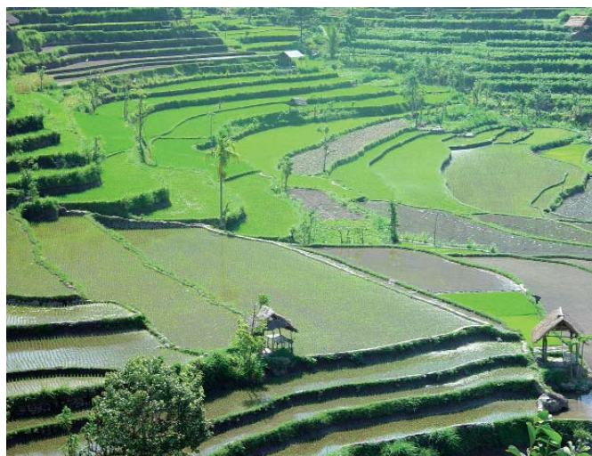
Traditional rice growing can use twice as much water as the SRI method.

Boosting water productivity – achieving more “crop per drop” – is essential for feeding the world’s growing population while protecting freshwater ecosystems and stopping aquifers from being sucked dry. A set of principles and methods called the System of Rice Intensification (SRI) holds the promise of a dramatic