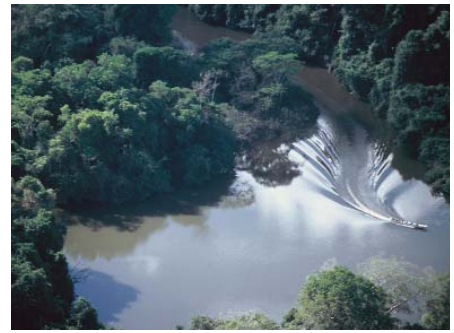
Tributary, Xingu River, Brazil.

■ Fifth anniversary of WCD report: In November, representatives of governments, NGOs, academia and private banks commemorated the launch of the WCD report five years earlier at an international conference organized by IRN in Berlin. The participants took stock of the implementation of the WCD's recommendations, and discussed the report's future perspectives.