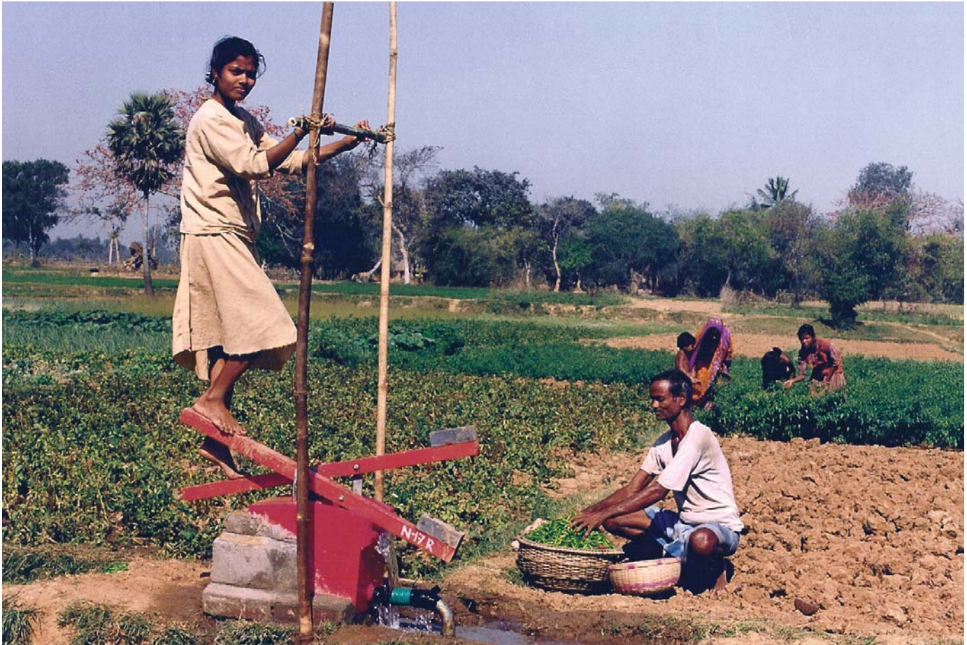
Treadle pumps have enabled more than 1.5 million Bangladeshi farmers to grow marketable produce.

half by 2015. With business as usual, however, we have little hope of achieving most of the Millennium goals, no matter how much money rich countries contribute to poor ones.