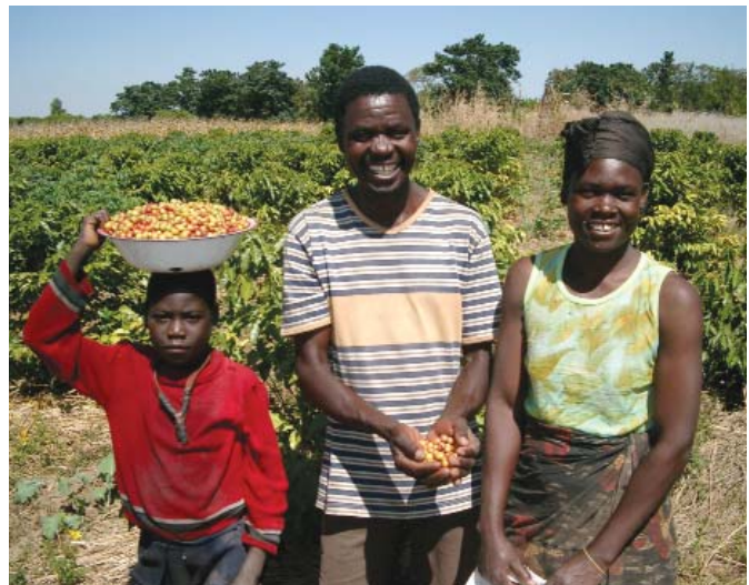
A family in Zimbabwe shows off their drip-irrigated coffee crop.

Another promising idea is to use drip and sprinkler systems in combination with the irrigation canals that lace croplands in India, China and other countries. Farmers on canals can get water only when their turn comes, and canal systems typically deliver water every two to three weeks, instead of the two- to four-day cycle that most high-value crops thrive on. Installing small storage tanks along the canals would enable farmers to irrigate their fields between the scheduled times of water delivery. Farmers in