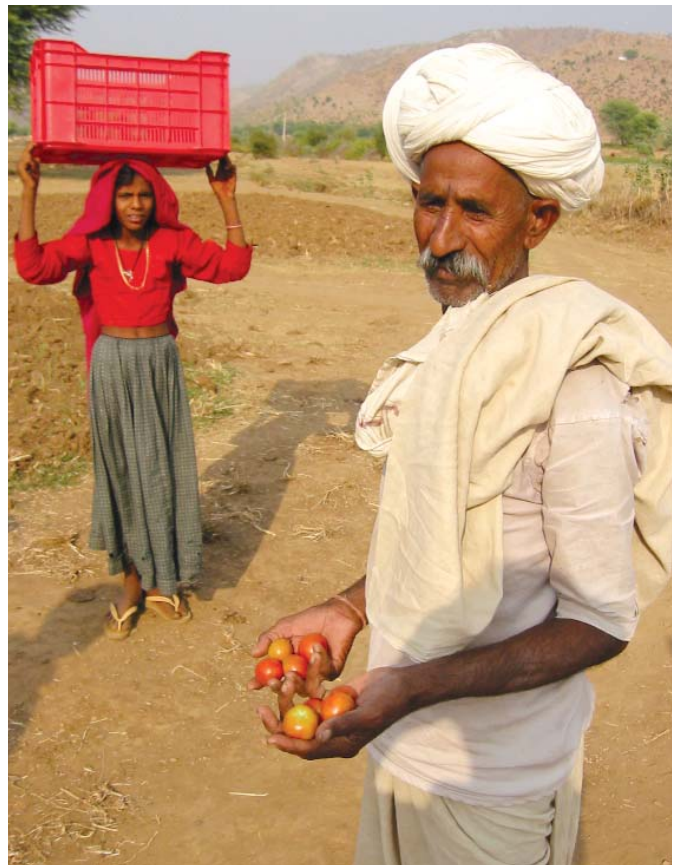
Rainwater harvesting has improved crop yields for this Indian family.