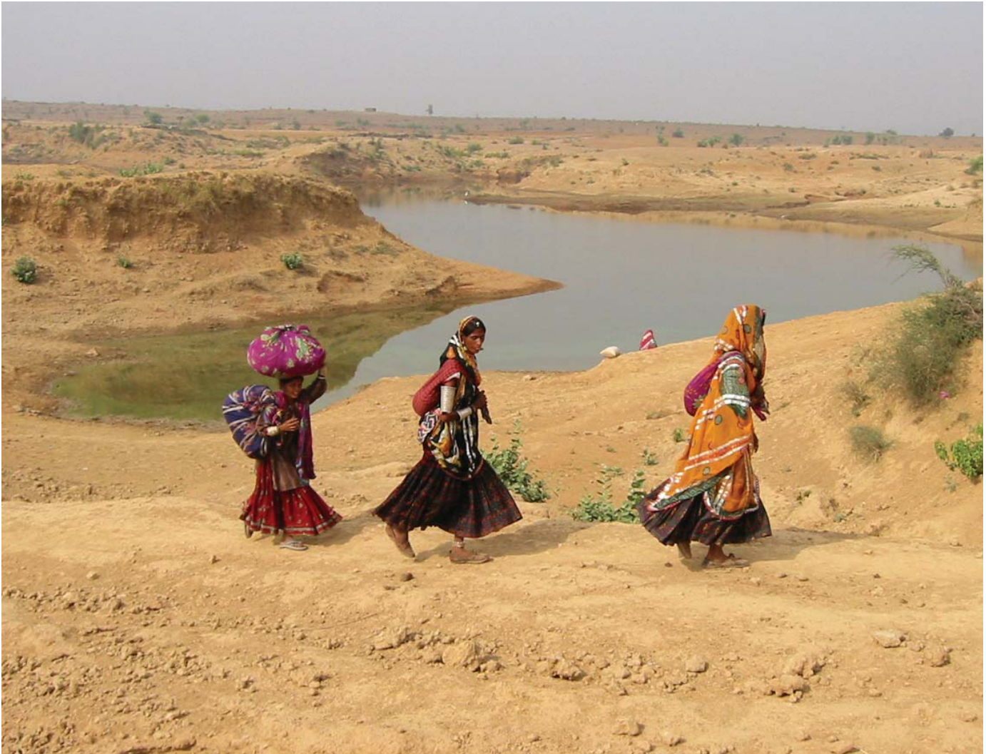
Arid Rajasthan state has been the center of India's growing rainwater harvesting movement. These women gather water at a basin built with the help of the NGO Tarun Bharat Sangh (see box, page 8).

able only for broad alluvial plains alongside major rivers. In Africa and Asia there are few appropriate sites left on which to expand irrigation mega-projects. 22