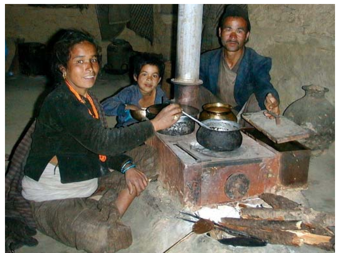
Using an improved cookstove in Nepal.

Cost-effective mechanical energy for driving sawmills, pumping water or grinding grain can be provided directly by small wind or water turbines, or, as with the treadle pump, by human labor. It can also be provided through biofuel or diesel motors.