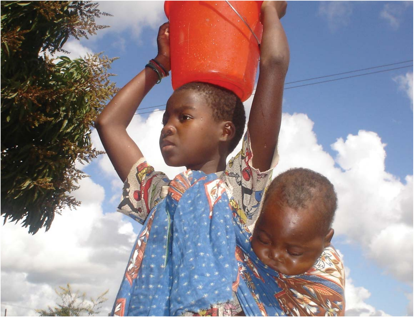
Women and girls do most of the water-fetching in the Zambezi River valley.

two MDGs most closely linked to water and energy management are those to “eradicate extreme poverty and hunger” and “ensure environmental sustainability.” Indicators for reaching these two Goals include halving by 2015 the proportion of people whose income is less than a dollar a day and, over the same period, halving the proportion of people without sustainable access to safe drinking water and basic sanitation. Achieving the other MDGs, especially those on gender equality and health, is also inextricably linked with increasing access to water and energy.