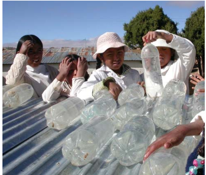
Children in Bolivia purify water using solar-water disinfection method.

7. The Rainwater Harvesting Implementation Network (RAIN) focuses on field implementation of small-scale rainwater harvesting projects, capacity building of local groups, and knowl-