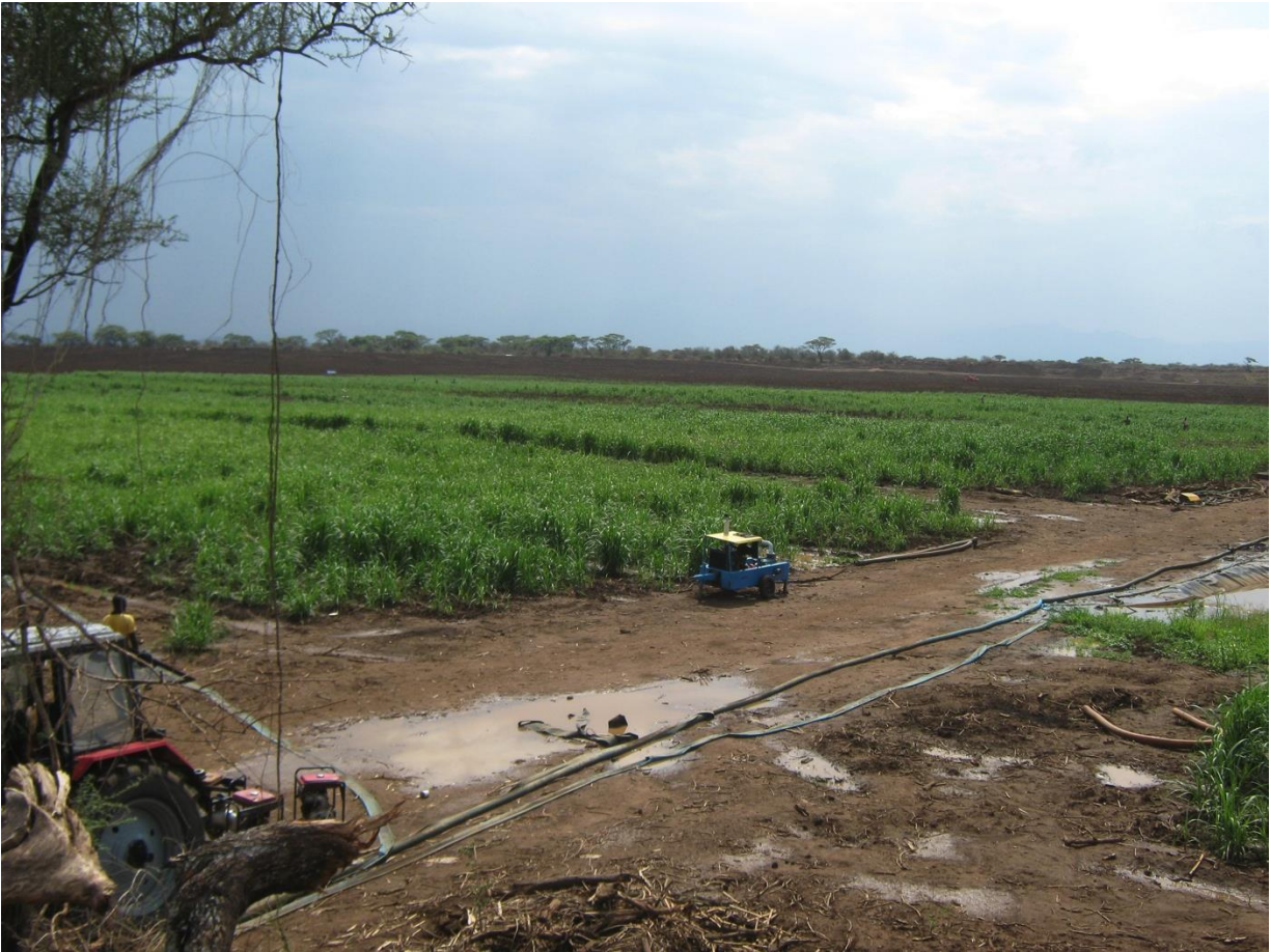
Sugar Plantation in the Omo.

The possibility of using the Omo River to irrigate massive agricultural areas in the Lower Omo Basin has been formally considered for decades. The Ethiopian Government's Omo-Gibe Basin Master Plan (1996), financed by the African Development Bank, revealed that upriver dams on the Omo River would be necessary to supplement the river's low flows for irrigation needs. It also noted that the process of developing the region would require transboundary dialogue with Kenya and the involvement of local people in negotiations to ensure that they were able to meet their own development priorities and that impacts on their resources were minimized. The document also pointed out that water levels in Lake Turkana could permanently drop from irrigation (Avery, 2012).