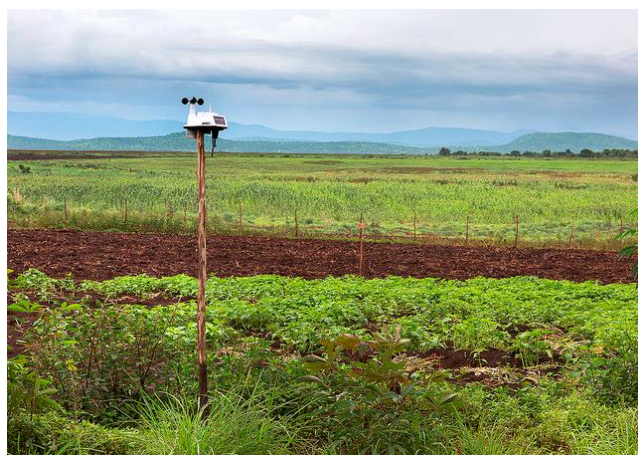
Sugar plantation.

Ethiopia has ambitions to become one of Africa's main sugar producers (World Bulletin, 2014). The government has made plans to increase production from 300,000 tons to 2.25 million tons per year by building sugar factories and increasing sugarcane cultivation as part of the first phase of Ethiopia's Growth and Transformation Plan (Mwanza, 2014). Large amounts of infrastructure for production of sugar and ethanol are being developed. In the South Omo Zone, 200,000 hectares of state-run sugar plantations and seven sugar processing factories are planned. The first of the seven factories is expected to be fully operational in 2015 and will be able to crush 12,000 tons of sugarcane per day