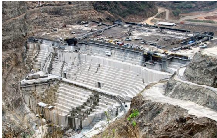
Gibe III Dam under construction.

The cornerstone of agricultural developments in the Omo Valley is the Gibe III Dam on the Omo River. Gibe III will regulate floods and raise dry season river flows, thus providing a year-round source of water and enabling large-scale agricultural development. When completed, Gibe III will be 243 meters high and potentially provide 1,870 MW of electricity, equal to the entirety of Kenya's current electrical generating capacity (Avery, 2013). In September 2014, the Ethiopia Electric Power Company stated that the dam was 87% complete and that power production was expected to begin in the spring of 2015 (International Water Power & Dam Construction, 2014).