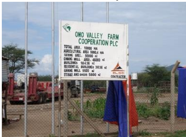
Lower Omo cotton farm.

China, Germany, and Turkey are currently the main markets for Ethiopian textile products (Getachew, 2014a). Western companies such as Primark, Ayka, H&M, and Asda have started production in Ethiopia, while others such as TUSKON (Turkey), Phillips –Van Heusen (US) and Jiang Lianfa Textile (Chinese) have visited Ethiopia for initial scouting trips (AllAfrica, 2014). However, doing business in the country carries some risk due to ethical questions about the expansion of the agricultural industry in certain areas