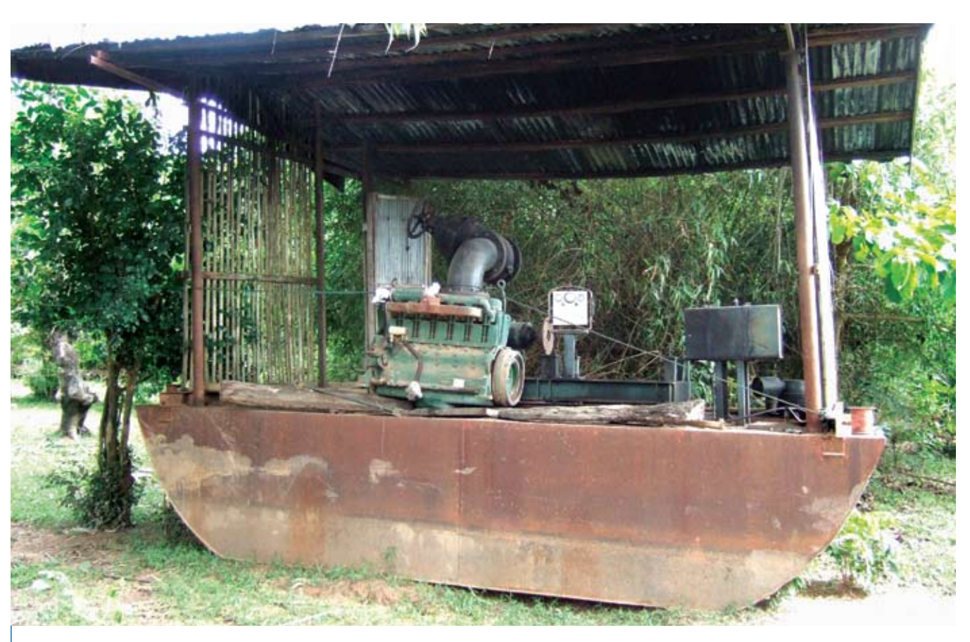
A broken irrigation pump left high and dry.

paid off or proven sustainable in the long run. One obvious reminder of the growing failure of this programme are the sight of abandoned pontoon-mounted pumps along the banks of the Nam Hinboun (see photo above).