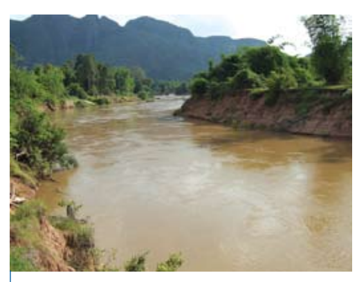
Nam Hai-Hinboun confluence at Ban Vangdao - site of the proposed bridge.

were told by the Deputy Manager of EMD that the suspension bridge was designed for the Nam Hai crossing at Ban Vangdao, and was awaiting budget approval to construct it. Villagers in Ban Vangdao and Ban Kongphat expressed hope that it would be built soon, as they were worried about the safety of themselves and their children and it would make life much easier for many people if there was a bridge. In May 2007, there was no sign of a bridge or even the wire pulley system for pulling a boat across and the crossing was now wider and more dangerous than ever, due to steeper and more eroded banks.