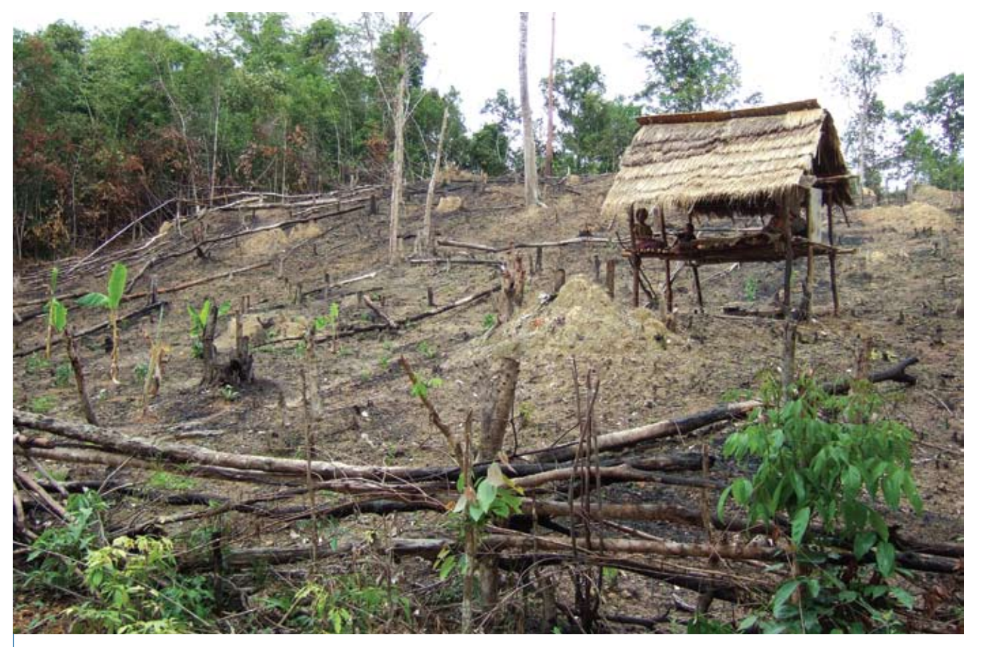
Ban Xang hai expansion.

Overall, the village has changed from a position of rice self-sufficiency to one of deficiency during the last decade. Villagers are convinced that the primary cause is altered flooding patterns as a result of THPC water releases into the Nam Hai-Hinboun rivers. When asked how villagers were coping with the rice shortage problem, the headman told us they were now doing day labour jobs to earn money to buy rice,