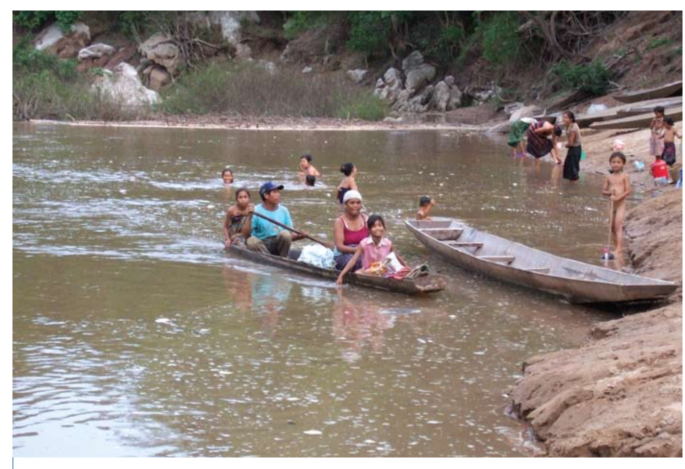
Ban Thonglom villagers bathing in the river as well water is insufficient.