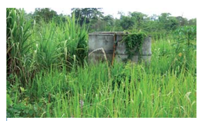
Imperata grass invades an abandoned replacement garden in Ban Xang.