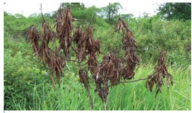
Mango and other fruit trees have died as a result of worsening floods.