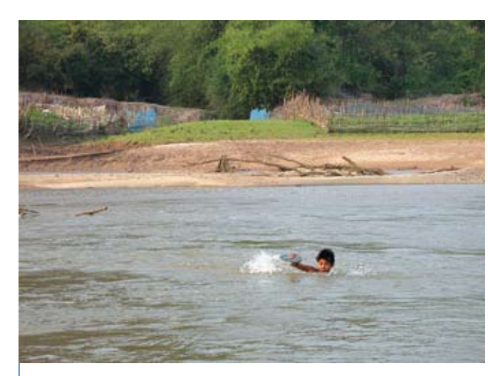
Child swimming across the river near Ban Tha.

While people have become steadily more used to the fluctuating water levels and alterations in current velocity over the years since the dam was commissioned, many people