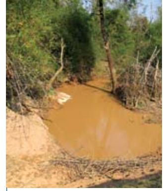
Ban Kongphat fishpond dam erosion (top), and Ban Tha fishpond (above).

These villages have a combined household