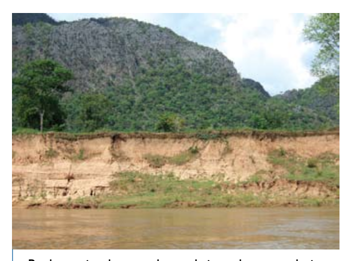
Bank erosion has accelerated since dam completion.

Below the Nam Hai – Nam Hinboun confluence, areas of rapid erosion are still highly evident, with many sections of undercutting, slumping, shearing and collapsing banks all the way down to Ban Nong Boua and beyond. It was quite apparent that sedimentation features tended to become more common the further downstream one goes from the