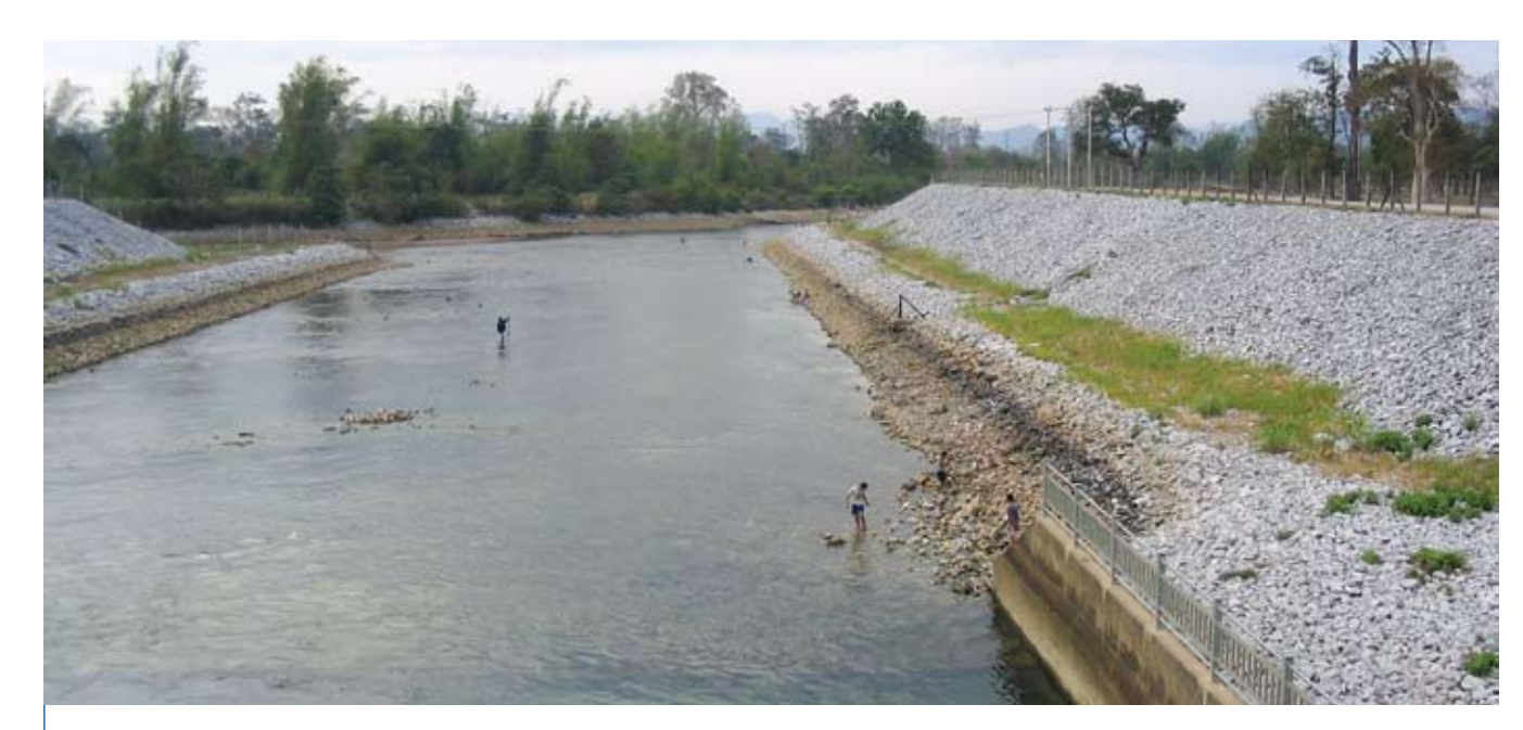
Re-regulation pond outlet at Ban Namsanam during a period of low water caused by turbine shutdown, allowing villagers to fish temporarily.

The review was completed on schedule in March 2004, but was not released by the company until a year later. The review found the EMD to be generally efficient and performing its functions well. However, the team did have concerns about issues of equity, participation and inclusion of all affected persons. Some activities were seen as having questionable sustainability and others, such as fisheries compensation measures, had yet to begin.