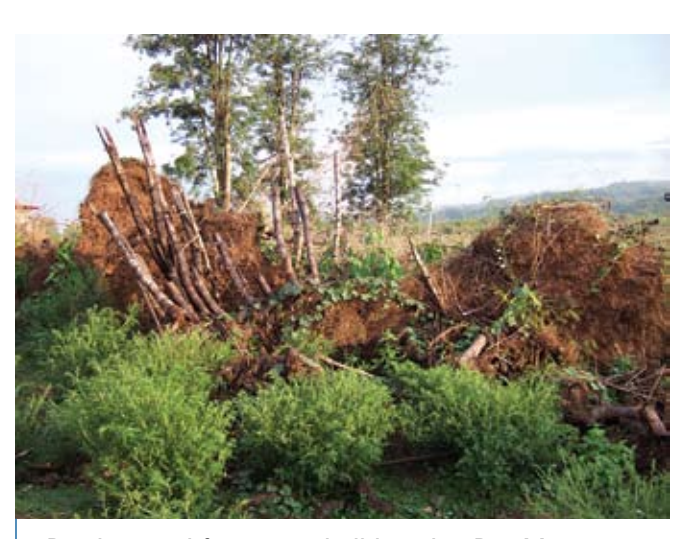
Bamboo and fruit trees bulldozed in Ban Xang.

From the villagers' perspective, perhaps the issue which most concerned them during our visit was the presence of Oii-LPFL and its expanding operations locally. This issue was raised time and again in conversations with villagers, who were caught between a rock and a hard place. On one hand they are watching the forest, the source of much of their food and livelihood, being destroyed before their eyes, while on the other hand their impoverished economic circumstances caused by rice deficiency means they feel obliged to work for Oji-LPFL for a daily wage equivalent to about US$2. For this they must work nine hours a day cutting undergrowth, making fences and planting eucalyptus seedlings. Children as young as ten or eleven years old are working in the plantations (confirmed by several villagers and headman).