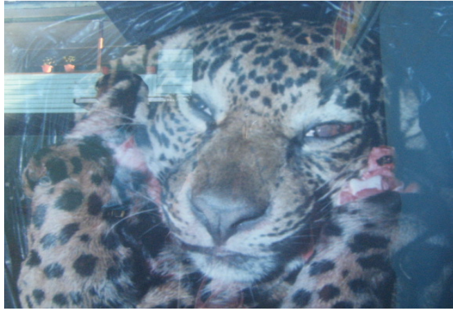
A jaguar poached outside of Boquete.

and Tayassu tajuca ), and jaguar. 150 The poachers reportedly enter the Park through three unofficial, but well-known entrances in Boquete. 151 While actual numbers on the amount of species under threat from hunting do not exist, uncontrolled poaching continues to pose a grave danger to the Park's outstanding biodiversity.