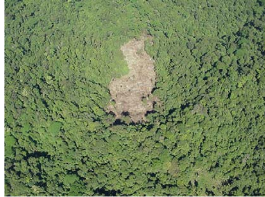
(circa 2005) Aerial view of deforestation in the Park.

Local environmental groups have filed lawsuits against illegal landholders. In one incident, an environmental group in Boquete, a town in Chiriqui Province abutting the Park, reported a man clearing forest to build a road leading to his illegal claim inside the Park. 142 The group filed a lawsuit to enjoin this particular activity, but the government has failed to prosecute all such actions and the problems continue. 143 In addition, in Las Nubes, another town in Chiriqui Province near the Park's boundary, several corporations claim rights to land within the Park. 144 These corporations are the subject of a lawsuit because they have deforested large portions of the Park. 145 Furthermore, some of these corporations continue to violate the laws protecting the Park and, in some instances, have constructed ecotourism infrastructure inside the Park. 146 Thus far, the government has not redressed the controversy. 147 Taken together with the indigenous settlements, these landholdings have cleared approximately 4,000 ha of forest, or two percent of the Park, between 1986 and 2000. 148 The current level of deforestation is unknown.