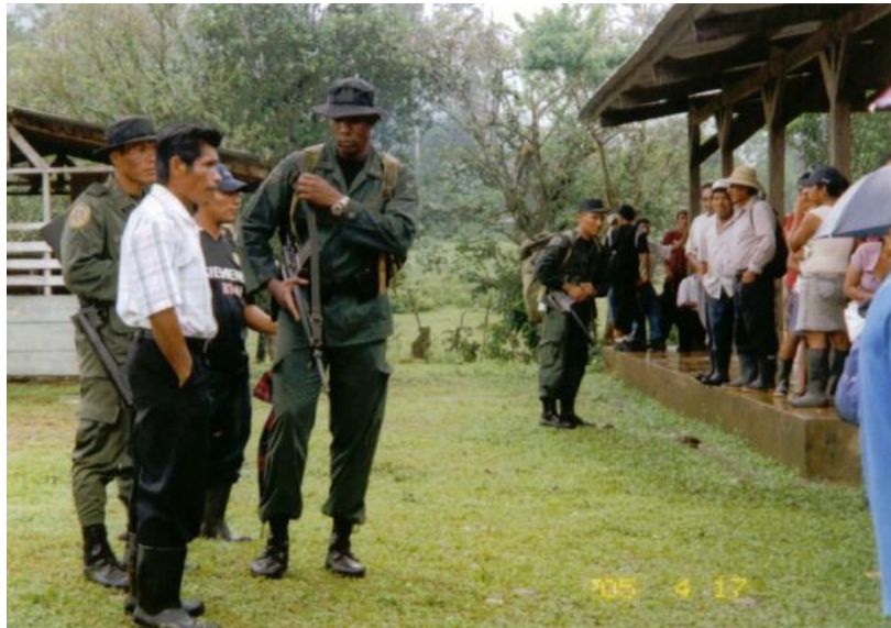
Panamanian armed policemen at a Naso General Assembly meeting.

exacerbated the armed conflict between the government forces and the Naso people, the majority of whom oppose the Bonyic Dam. 105