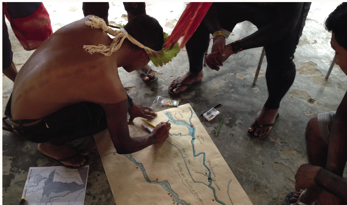
JURUENA RIVER | Apiaká map the Juruena River in Brazil.