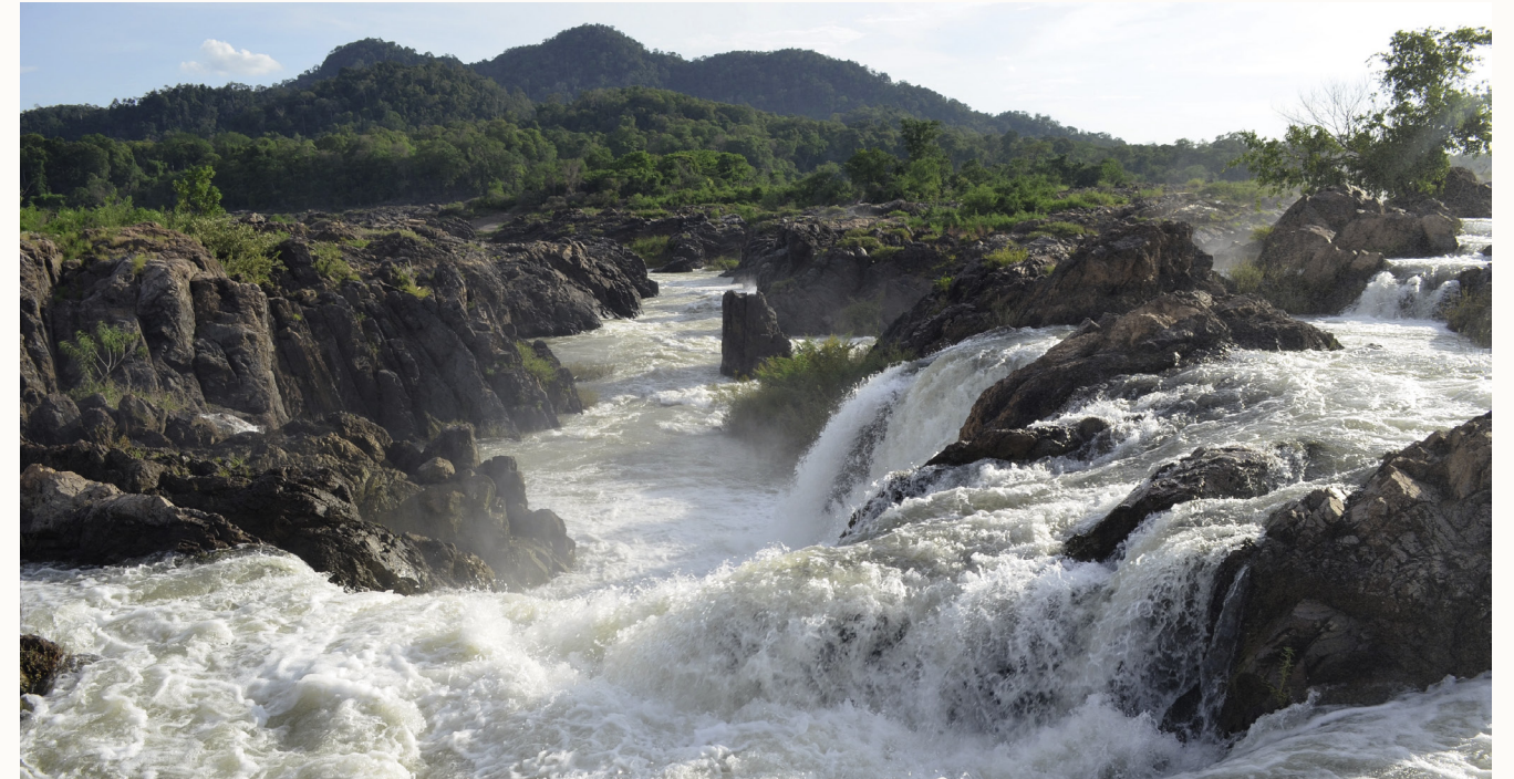
MEKONG RIVER | Rapids in Siphandone.