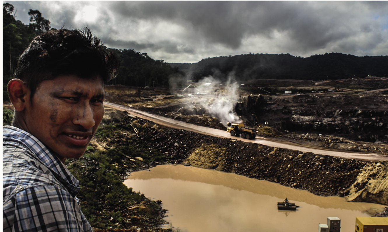
TELES PIRES RIVER | At the São Manoel Dam construction site on Brazil's Teles Pires River in 2015.

developed a Sustainability Protocol in which it recognizes the unacceptable nature of the impacts of its business on human rights, societies and the environment. 12 Across these contexts, there is a growing recognition that environmental and social costs and benefits must be counted equally alongside the economic ones. Yet key processes such as strategic environmental assessments and international norms, including the right to Free, Prior, and Informed Consent of Indigenous Peoples, while increasingly recognized on paper by key dam stakeholders, are rarely implemented effectively.