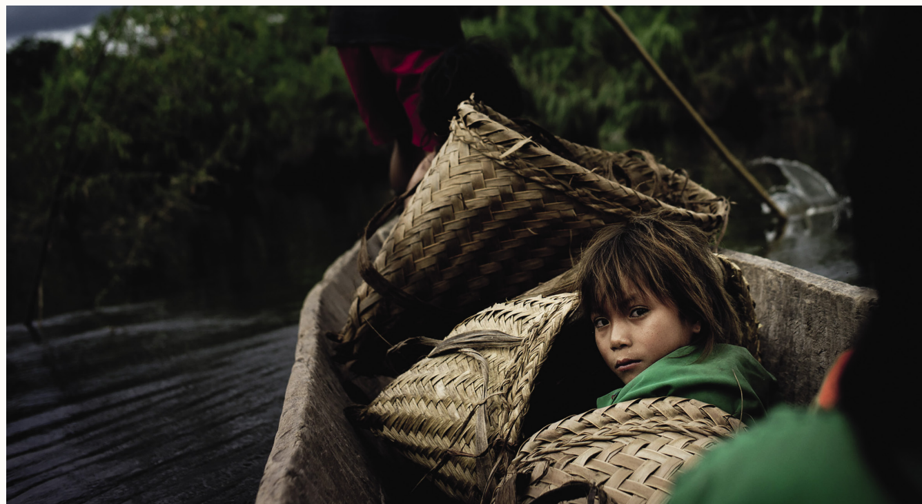
ENE RIVER | The Asháninka collect and share food on the Ene River in Peru.

Rivers are essential to all life on the planet. Free-flowing rivers work like arteries, providing the world’s ecosystems with critical freshwater resources. These resources nurture the animal and plant life within rivers, recharge fertility in floodplains and provide nutrients to delta, estuarine and near-shore reefs. Rivers sustain extensive fisheries globally, with freshwater fisheries estimated to feed up to 550 million people, while river floodplains feed hundreds of millions more. 1 Rivers are a source of magnificent biodiversity, and a refuge for endangered species.