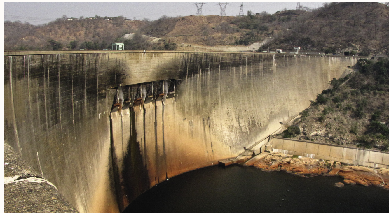
ZAMBEZI RIVER | The Kariba Dam blocks the Zambezi River.

Dams are fragmenting rivers and ecosystems, driving an unprecedented loss of freshwater habitat and biodiversity. Much of the variety of freshwater life is determined by the connections formed between different parts of a river basin. Despite well-documented dangers, more than 3,700 hydropower projects are planned or under construction on the world’s rivers. If built, they could block free-flowing rivers by more than 20%. 8 The implications are critical: freshwater ecosystems sustain a higher biodiversity per square mile than almost any other ecosystem. 9 Their fisheries are crucial to food security and livelihoods for millions of people. 10 Large, destructive dam projects can permanently alter an entire watershed, displacing tens of thousands of people