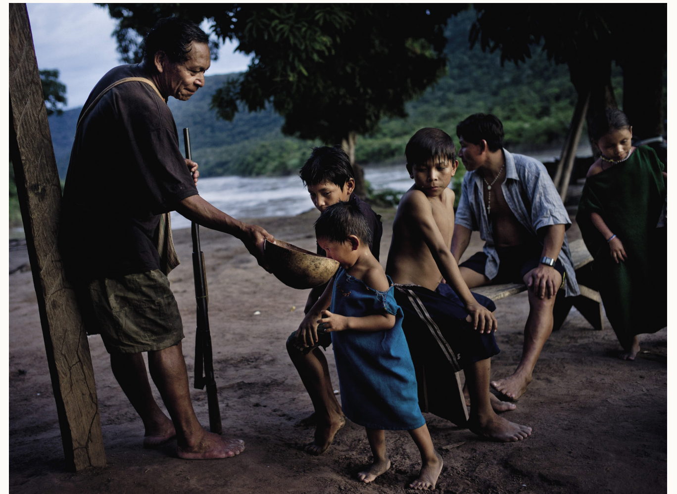
ENE RIVER | Children drink masato on the shores of the Ene River.

Since 1985, International Rivers has been at the heart of the global struggle to protect rivers and the rights of communities that depend on them.